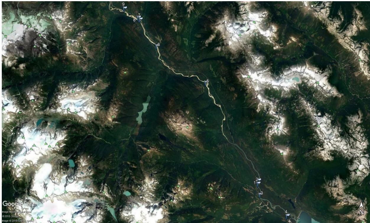
Figure 1. Image from Google Earth showing the locations of each site surveyed on the Lower Lillooet River on 8 August 2018.