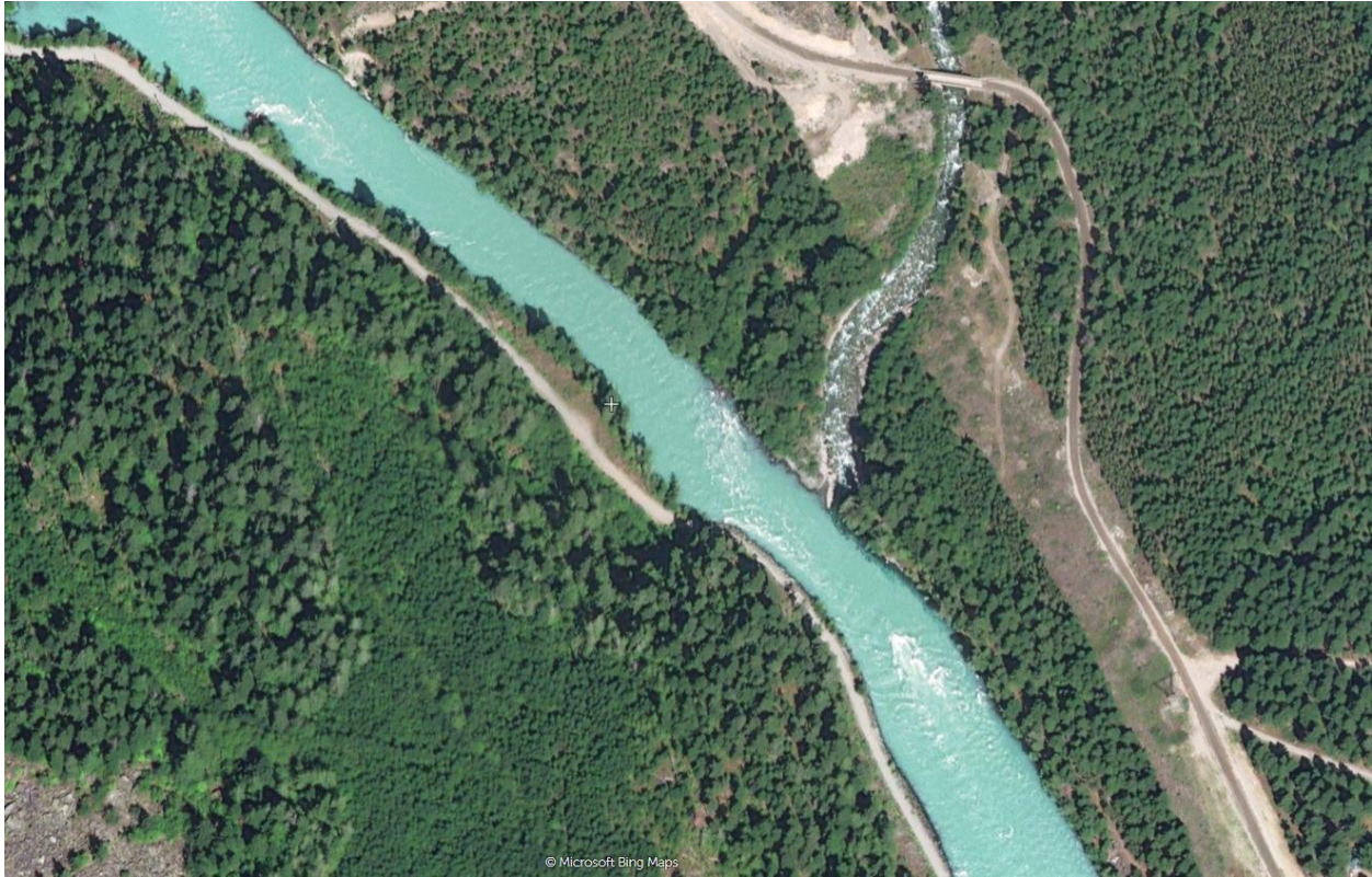
Figure 2. Image from Zoom Earth of the Lillooet River at Rogers Creek showing a potentially suitable location for using imaging sonar to estimate the number of Coho salmon migrants.

(approximately 50 m), absence of rapids or highly turbulent areas, absence of large boulders that would obstruct the ability to image across the river, ease of access from West Lillooet Lake Road, and presence of a community gathering structure that may be used to house electronic equipment and on-site technicians.